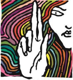
Hungarian Helsinki Committee