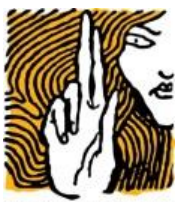
Hungarian Helsinki Committee

In the refugee camp you get a bed and 3 times food every day (or in some camps money to buy food for yourself, around 1000 Hungarian forints per day). You get pocket money , around 8000 Hungarian Forints (=25 EUR) every months. You have to get a humanitarian residence card ( hum.tart ) with your personal data. You can ask for the doctor if you have medical problems and you should get basic health care.