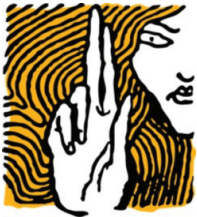
Hungarian Helsinki Committee