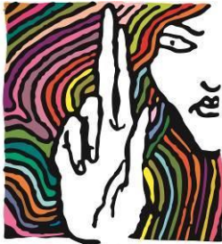
Hungarian Helsinki Committee